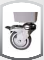
Heavy duty casters