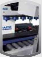
Random top squeezers