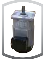
1/3 hp motors for heavy duty usage