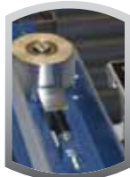
Self-tensioning & tracking side drives simplify belt replacement