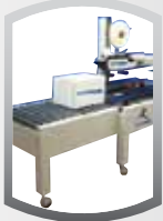
Infeed & exit tables