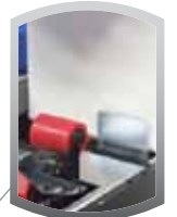
Index gate positions case for proper processing