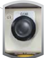
"Clear" button for jams & replacing bottom tape roll