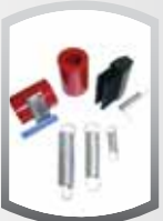
Spare parts kits