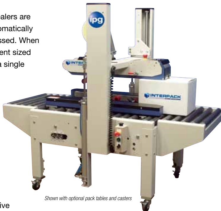
Shown with optional pack tables and casters

When you compare features, benefits and value, Interpack Case Sealers are the right choice for operators, plant engineers, maintenance and purchasing.