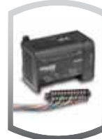
Digital pneumatics to improve throughput speed